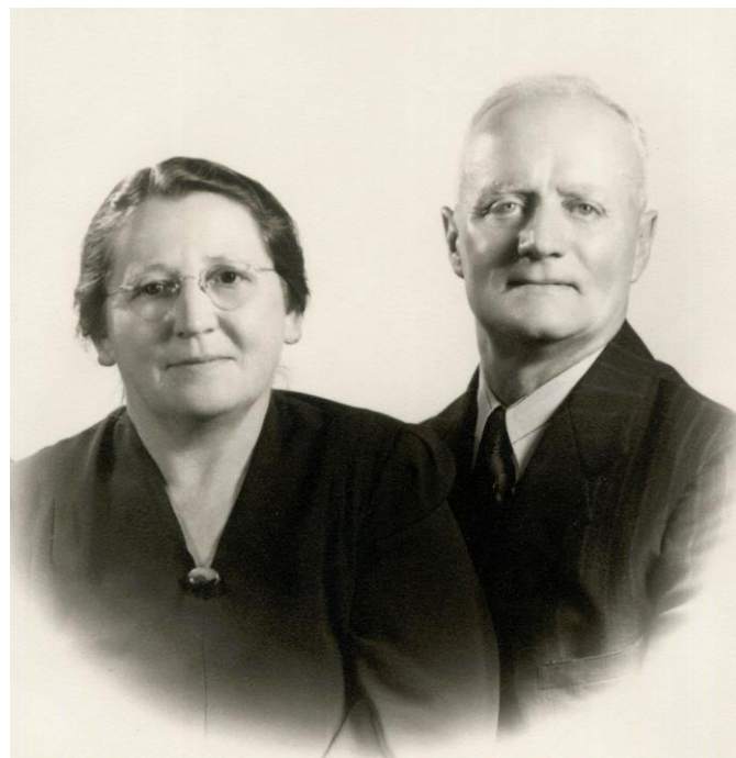
40 th Wedding Anniversary