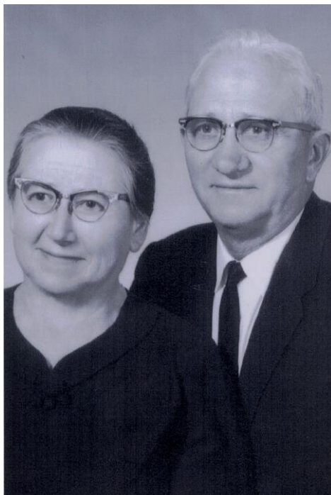
40 th Anniversary