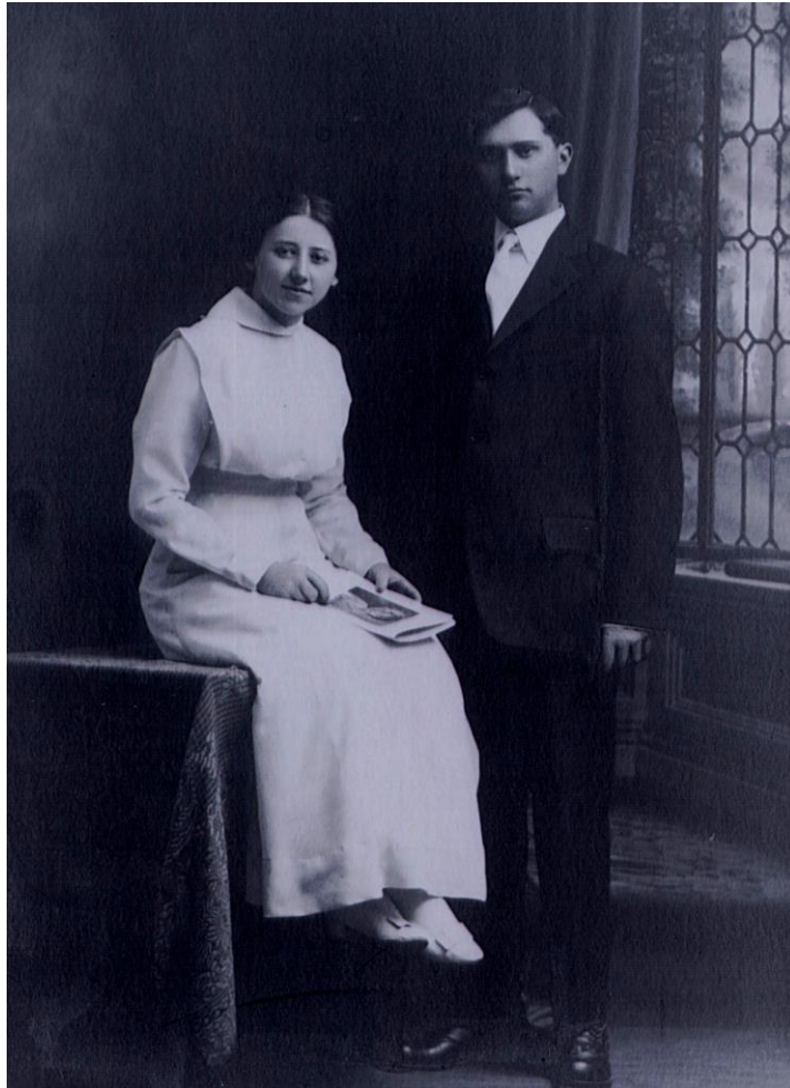
Wedding photo, March 20, 1915