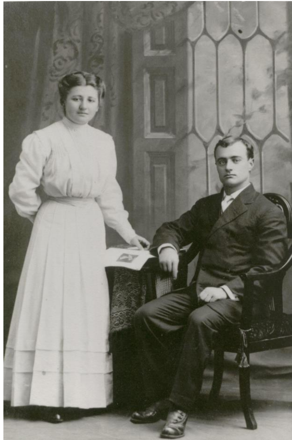
Wedding photo, Nov. 7, 1911