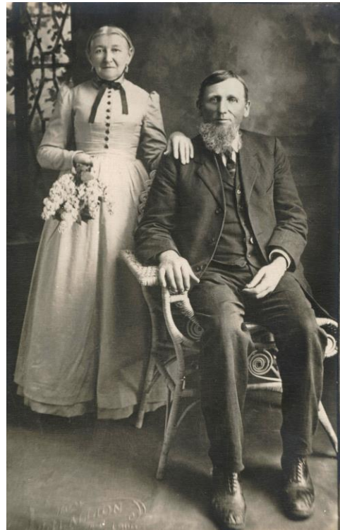
In later years . . .